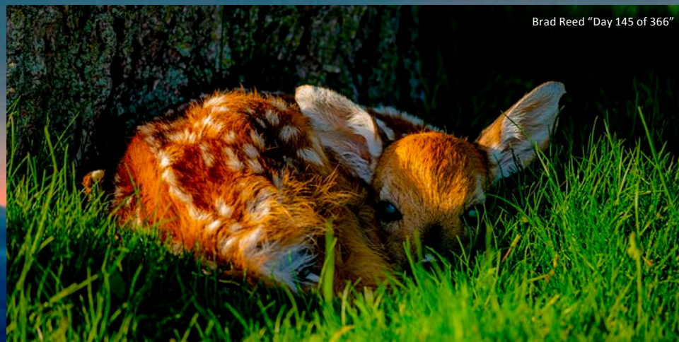
Brad Reed "Day 145 of 366"