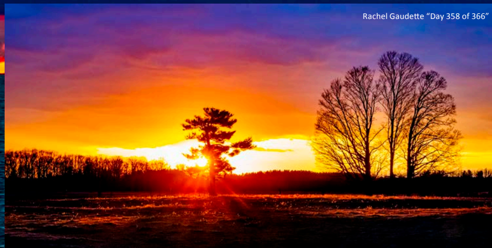
Rachel Gaudette "Day 358 of 366"