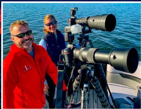
Background Photo by Brad Reed "Day 37 of 366"